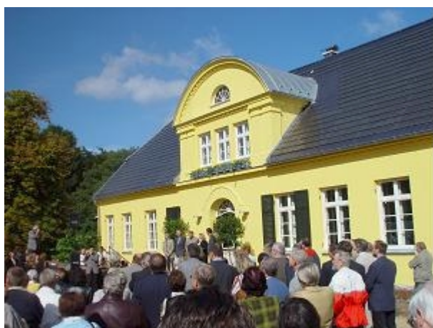
Grand opening of the convention centre