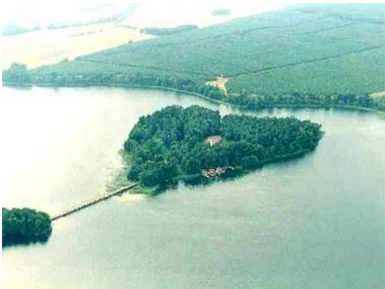
Aerial view of „Brückentensee“