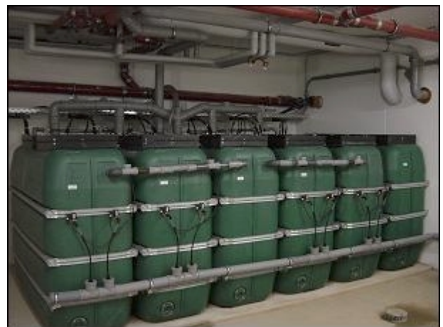
Installation of the membrane bioreactors in a separate room