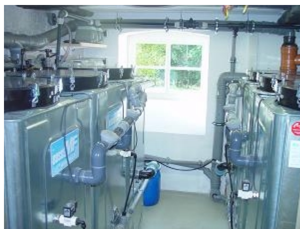
Installation of the membrane bioreactors in a separate room