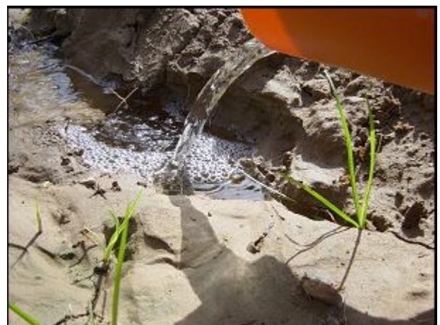
Irrigation of the desert with micro filtrate (outlet)