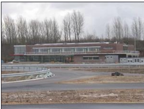
Main building of the training school