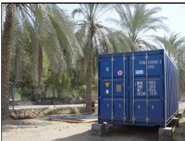
View from the outside