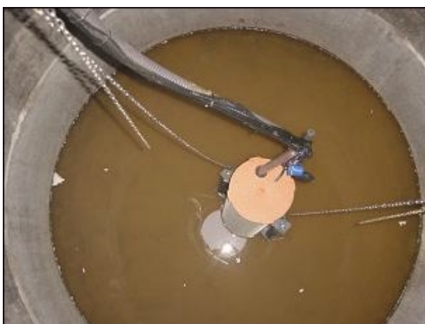
Septic tank with submerged pump and coarse matter separator