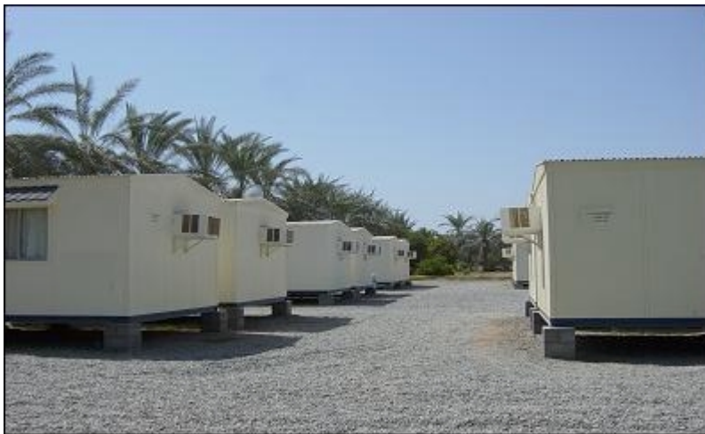
Camp in the desert