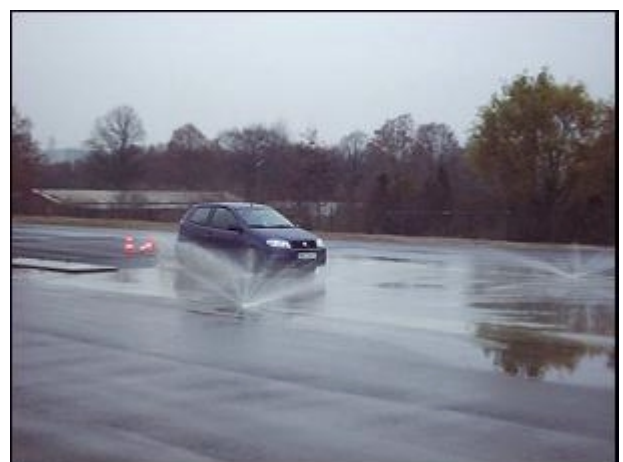
Irrigation of the motorway