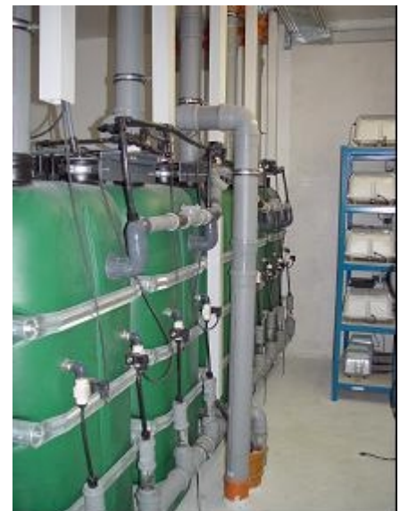
Installation of the membrane bioreactors in a separate room